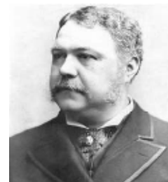
Chester A. Arthur Born - October 5, 1829 21st President of the United States of America

Would you like to see anything new in the clubhouse? Some exercise classes, games, social activities, discussion group, dancing, crafts; come forward and let us know. For example: start your own group; please let us know first how we can start something new. Call or come to the office, we would love to hear some new ideas.